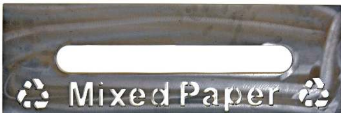
Laser Cut Signs & Pieces

Recent projects include producing garbage bin enclosures, food carts and bike rack signage for the streets of Vancouver.