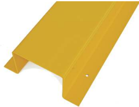
Pipe & Electrical Guards