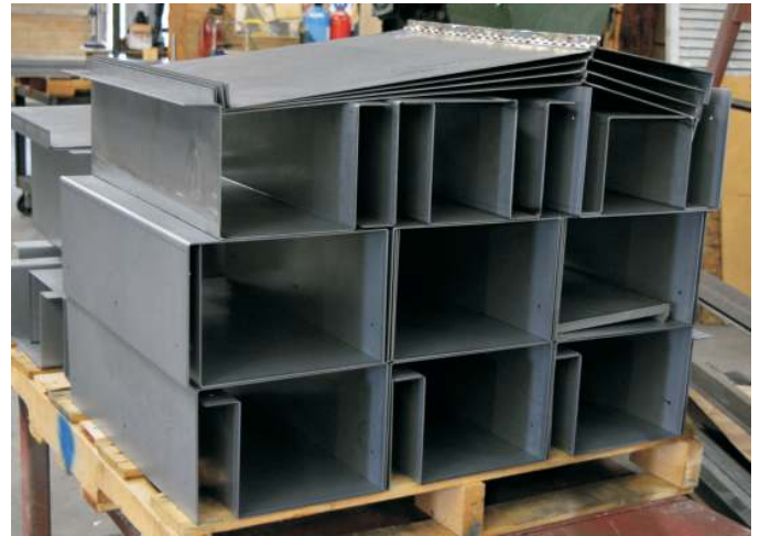
Formed & Welded Pipe Guards