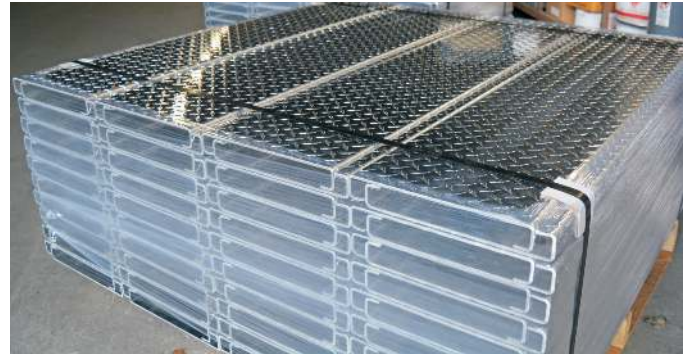
Formed Stairs made from Aluminum Plate