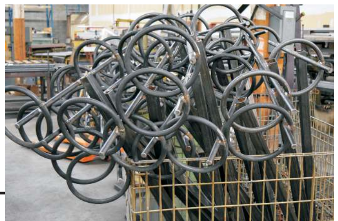
Bike Racks Cut, Formed & Welded