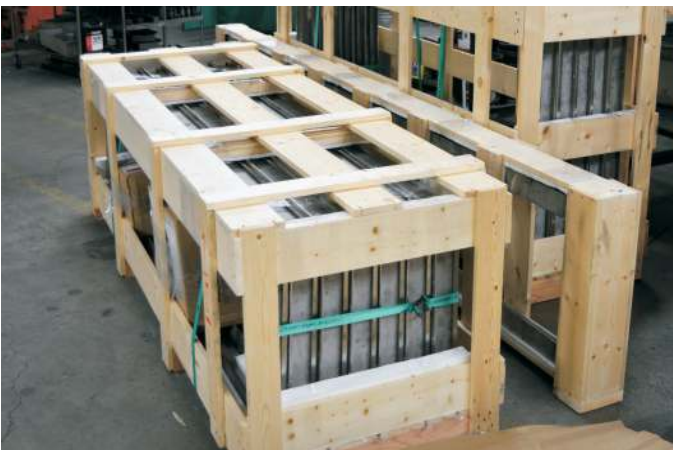
Crated Glass Frames for Export to USA