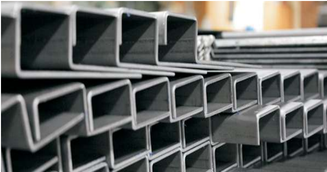
Formed Sheet Metal Channels