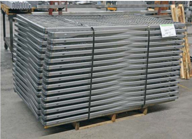
Formed & Welded Screens