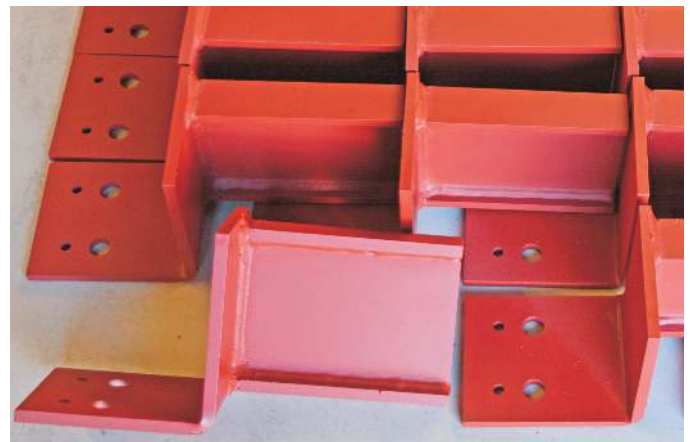
Brackets for a Glass Canopy.