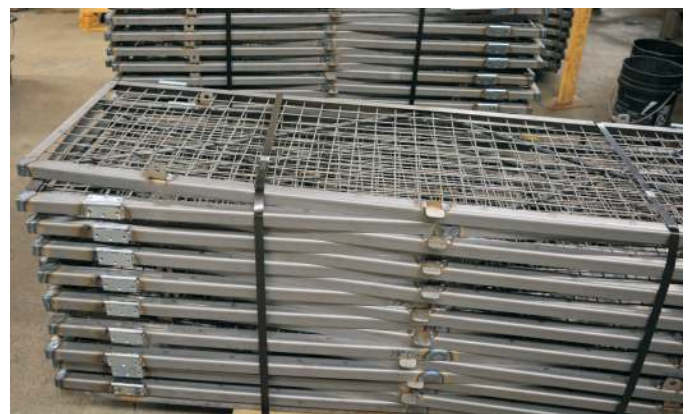
Metal Doors with Wire Mesh Screens..